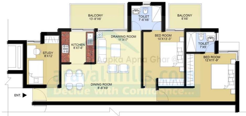
APARTMENT TYPE - B' (2 BEDROOMS+STUDY+2 TOILET), SALEABLE AREA=1300 SQFT

All Site plans, specifications, dimension, design, measurement and location are indicative and are subject to change as may be decided by the Company or Competent Authority. Revision, Alteration, Modification, Addition, Deletion, Substitution or Recast if any may be necessary during construction.