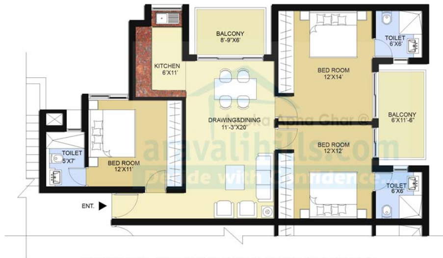
APARTMENT TYPE - A' (3 BEDROOMS+3 TOILET), SALEABLE AREA=1400 SQFT

All Site plans, specifications, dimension, design, measurement and location are indicative and are subject to change as may be decided by the Company or Competent Authority. Revision, Alteration, Modification, Addition, Deletion, Substitution or Recast if any may be necessary during construction.