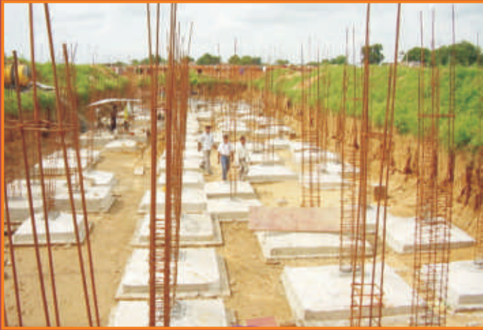
Actual Site Photograph of Avalon Homes, Bhiwadi