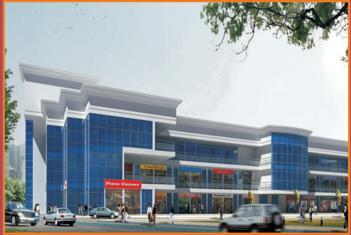
Perspective View of Avalon Plaza, Bhiwadi