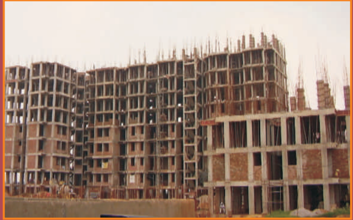
Actual Site Photograph of Avalon Residency, Bhiwadi