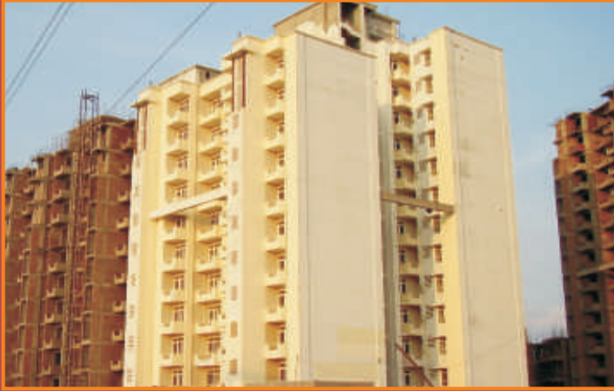
Actual Site Photograph of Avalon Gardens, Bhiwadi