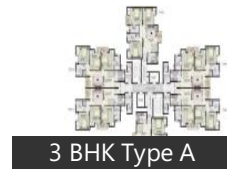
3 BHK Type A