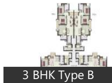
3 BHK Type B