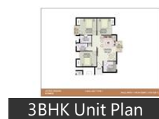
3BHK Unit Plan