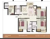
3BHK + Worker