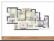
3BHK + Worker