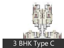
3 BHK Type C