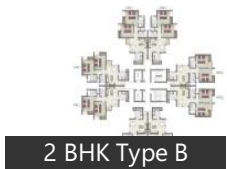
2 BHK Type B