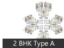
2 BHK Type A