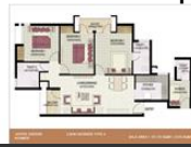
3BHK + Worker