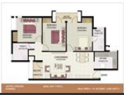
3BHK Unit Plan