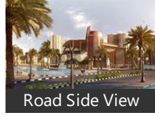
Road Side View