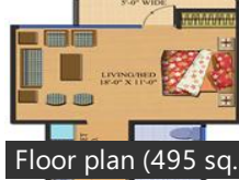
Floor plan (495 sq.