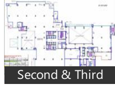
Second & Third