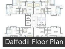
Daffodil Floor Plan