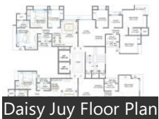
Daisy Juy Floor Plan