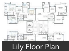
Lily Floor Plan