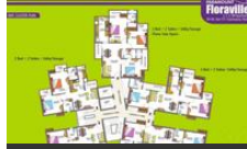
Cluster Plan 2