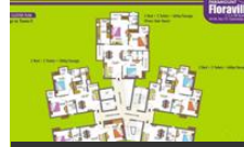
Cluster Plan 4