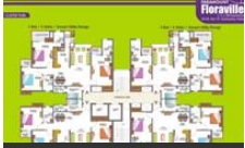
Cluster Plan 1