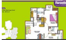
Floor Plan 2