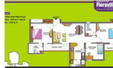
Floor Plan 4