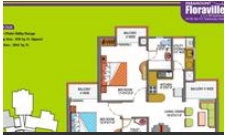
Floor Plan 1