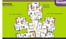
Cluster Plan 3