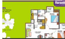
Floor Plan 3