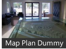
Map Plan Dummy