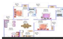
3BR+2T Floor Plan