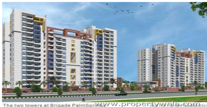
The two towers at Brigade PalmSprings

The best option of its class in J P Nagar