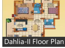
Dahlia-II Floor Plan