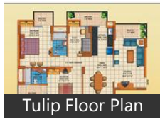
Tulip Floor Plan