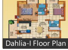
Dahlia-I Floor Plan