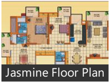
Jasmine Floor Plan