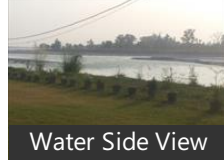
Water Side View