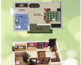
Studio Apartment -