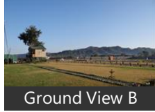
Ground View B