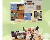
2BHK - 900 Sq. Ft.