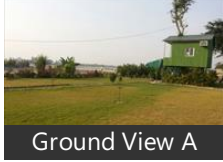
Ground View A