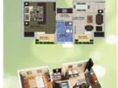
1BHK - 600 Sq. Ft.