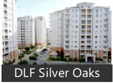
DLF Silver Oaks