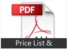
Price List &