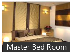
Master Bed Room