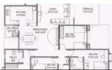
3 1/2 BHK Floor Plan