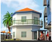
Upper Front View