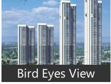
Bird Eyes View