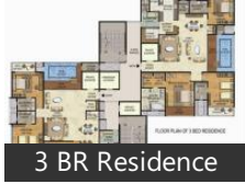
3 BR Residence