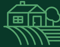
Spacious Farm House