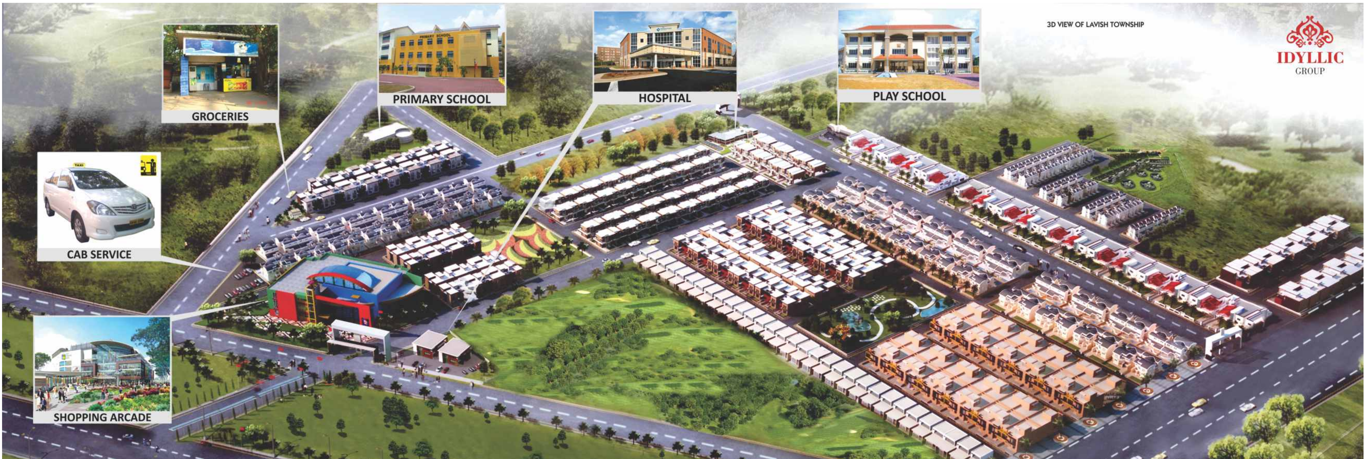
3D VIEW OF LAVISH TOWNSHIP