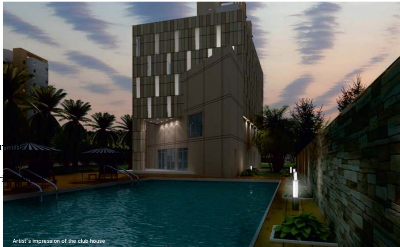
Artist's impression of the club house