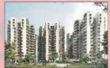
EKDANT FNG, Greater Noida

Disclaimer Visual representation shown in this brochure are purely conceptual. All building plans, specifications, floor plans and elevations are tentative and subject to variation and modification by the company of the competent authority sanctioning plans.