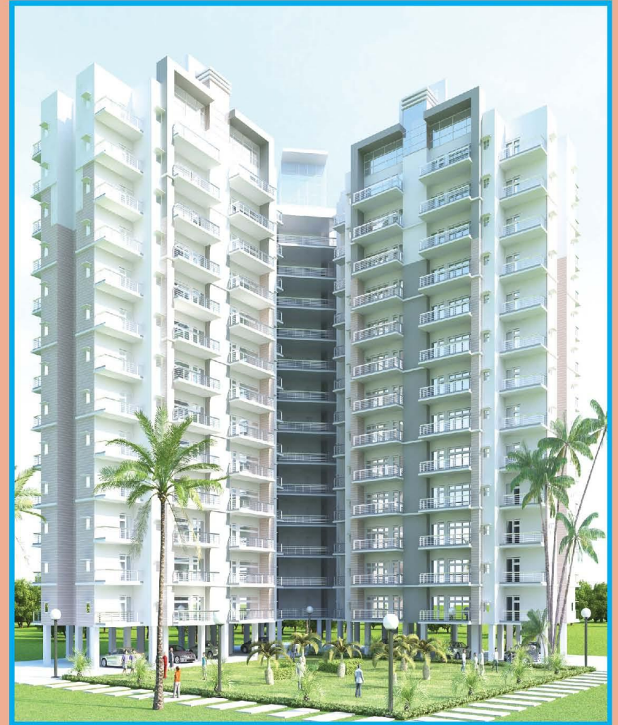
Swimming Pool • Health Club • Gymnasium • Tennis Court • Squash-court • Badminton Court