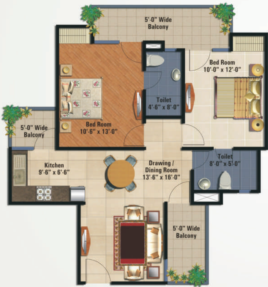
2 Bedroom Flat | Super Area - 1075 Sq. Ft. | Flat No. 4