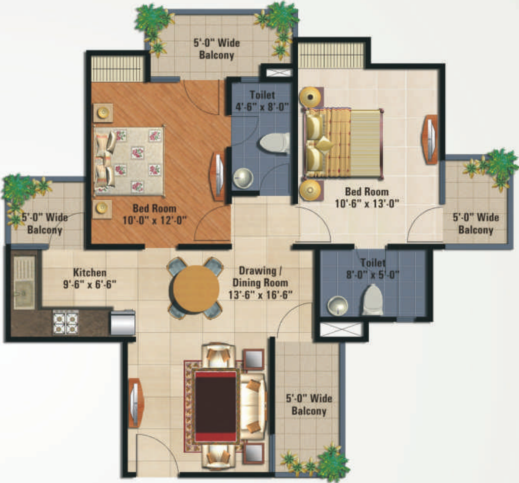
2 Bedroom Flat | Super Area - 1075 Sq. Ft. | Flat No. 5, 6