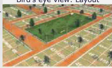
Bird's eye view: Layout