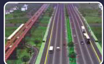
NATIONAL HIGHWAY - 5