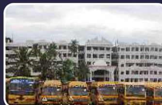
INTERNATIONAL SCHOOLS / COLLEGES