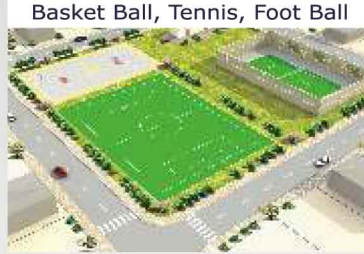
Basket Ball, Tennis, Foot Ball