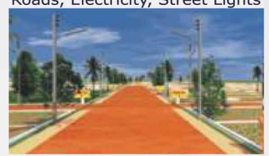
Roads, Electricity, Street Lights