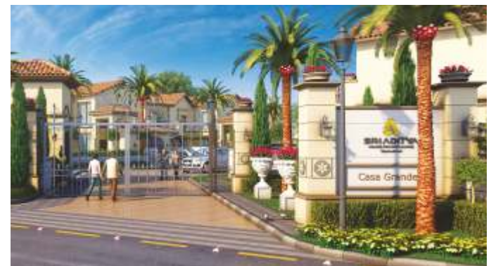
ADITYA CASA GRANDE