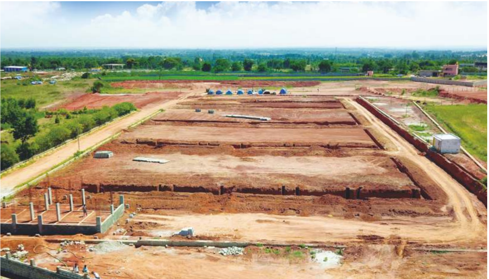
Actual image from site