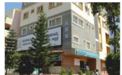
Ramaiah Leena Hospital