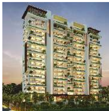
ADITYA LE GRANDIOSE