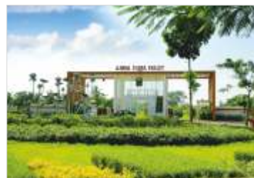
Ajmal Flora Valley