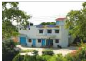
Devanahalli Railway Station