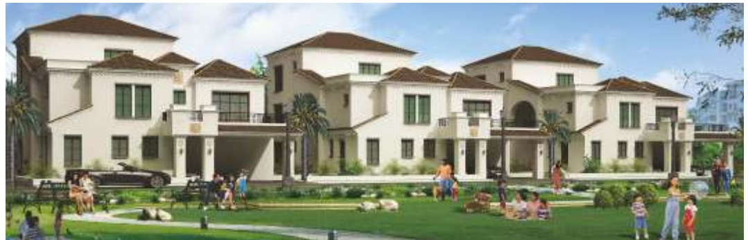
ADITYA ROYAL PALMS