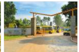
Anantha Vidyaniketan School