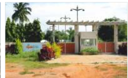
Sterling Hyde Park