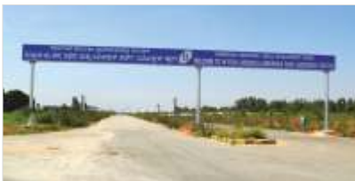
KIADB Aerospace SEZ