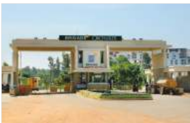
Brigade North Entry