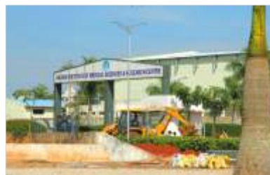
Akash Institute of Medical Sciences & Research Centre