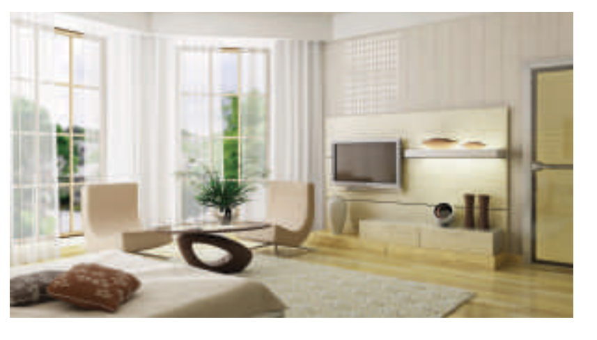
* All perspective elevations, images and colour schemes are purely conceptual and not a legal o erring