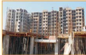
Actual Site Photograph of Avalon Residency, Bhiwadi