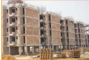
Actual Site Photograph of Avalon Homes, Bhiwadi