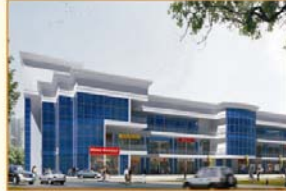
Perspective View of Avalon Plaza, Bhiwadi