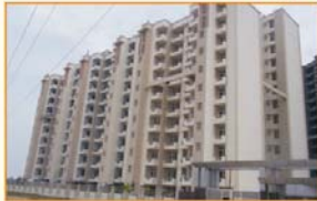
Actual Site Photograph of Avalon Gardens, Bhiwadi