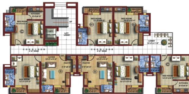
Ground Floor Cluster Plan Super Area - 850 sq. ft. 2 Rooms, Bathroom, Kitchen and Balcony