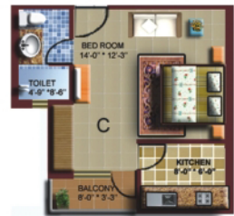
Unit Plan C Super Area - 500 sq. ft. 1 Room, Bathroom, Kitchen and Balcony