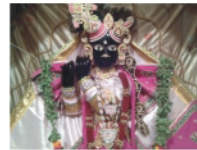
BANKEJI BIHARI JI TEMPLE