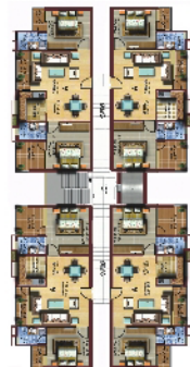
Ground Floor Cluster Plan Super Area - 1080 sq. ft. 2 Bedrooms + Drawing / Dining, 2 Bathroom, Kitchen and Balcony