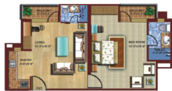
Ground Floor Cluster Plan Super Area - 425 sq. ft. 1 Room, Bathroom, Kitchen and Balcony