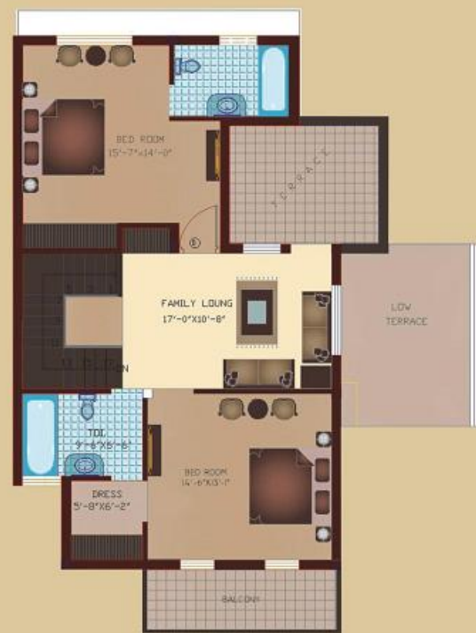
Platinum Villa 300 Sq. yds. First Floor