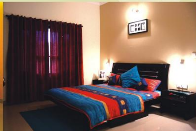
Actual sample apartment pictures.

The magnificent Golden Villas are an amalgamation of novel architecture, pleasing aesthetics and impressive designs which are ideal for independent living. The designer façade, front-gardens, beautiful interiors, spacious drawing and bathrooms are all designed to deliver an international lifestyle and class that underline your refined tastes.