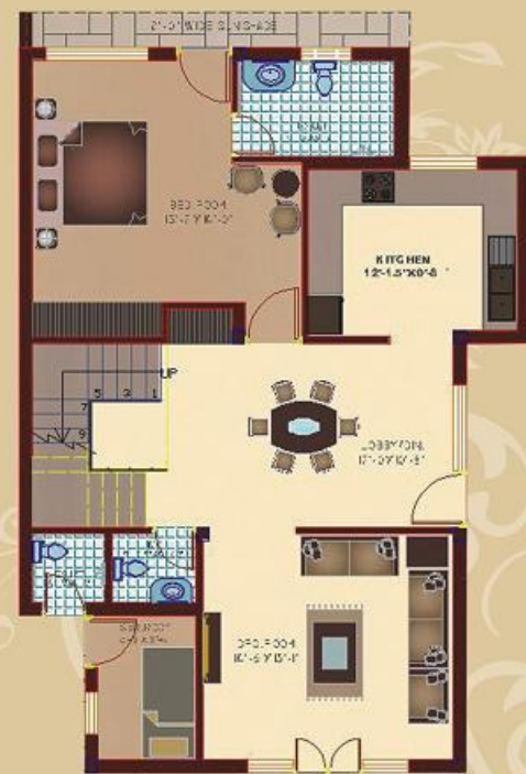
Platinum Villa 300 Sq. yds. Ground Floor