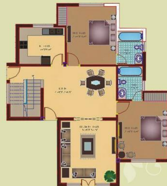
Golden Villa 1000 Sq. Yds.