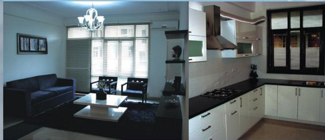
Actual Sample Apartment pictures.

Every dawn beckons you to indulge in the greenery that is invigorating and inspiring for you. It is akin to celebrating life in the lap of nature.