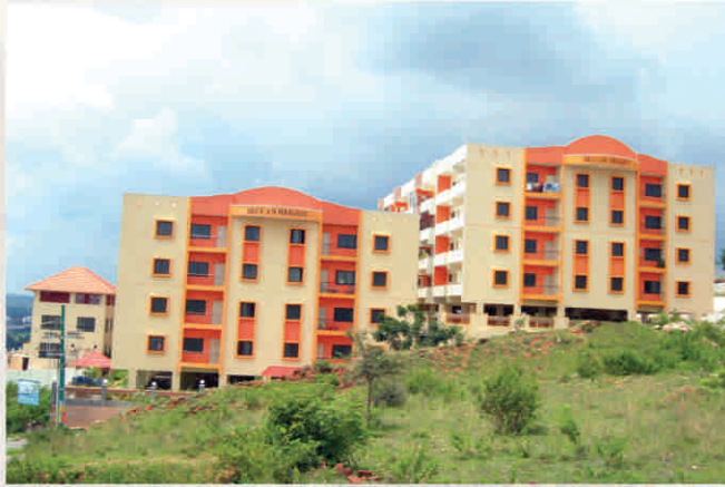
DECCAN HEIGHTS Rajarajeshwarinagar