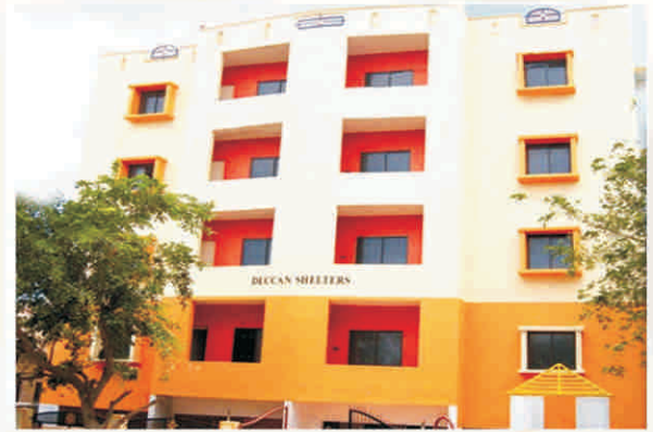
DECCAN SHELTERS Judicial Layout, Yelahanka