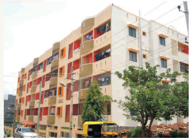
DECCAN GARDENIA Vijaynagar