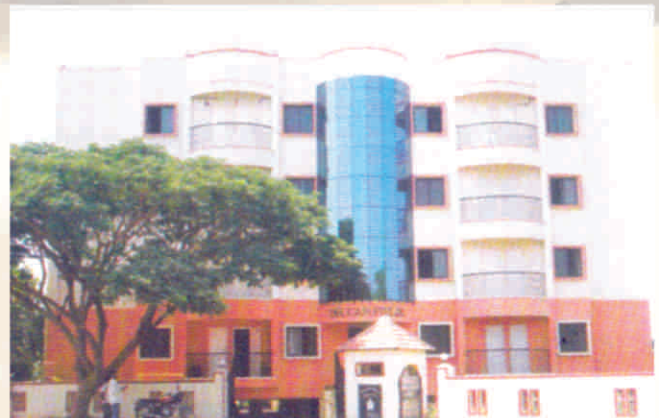
DECCAN FIELDS ITPL Road