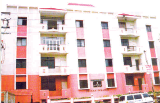
DECCAN PARADISE Basaveshwarnagar