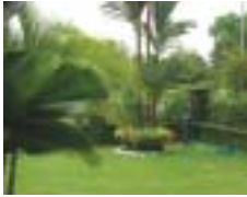
* Live Photos of Our Completed Projects