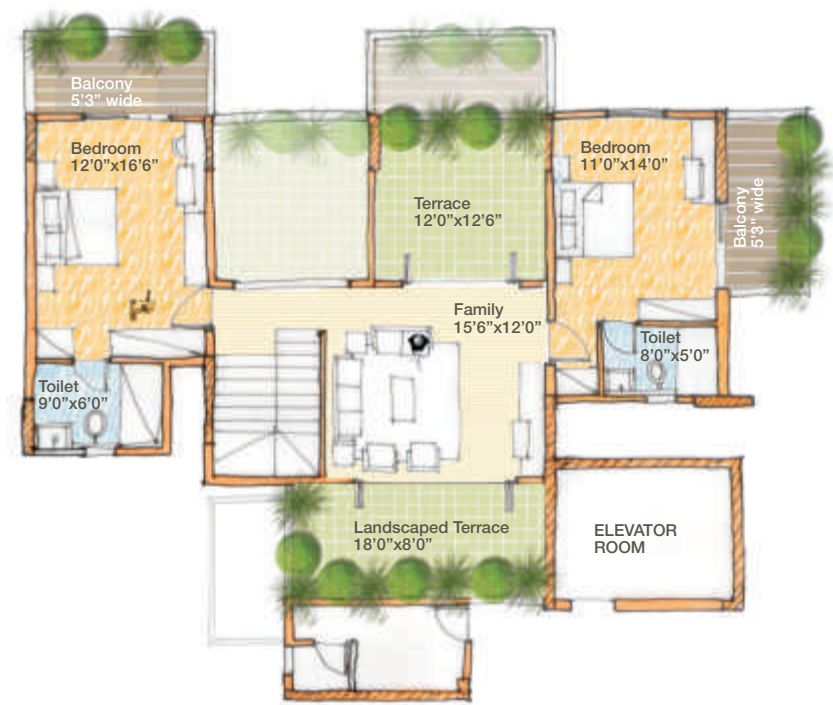
Level . 2