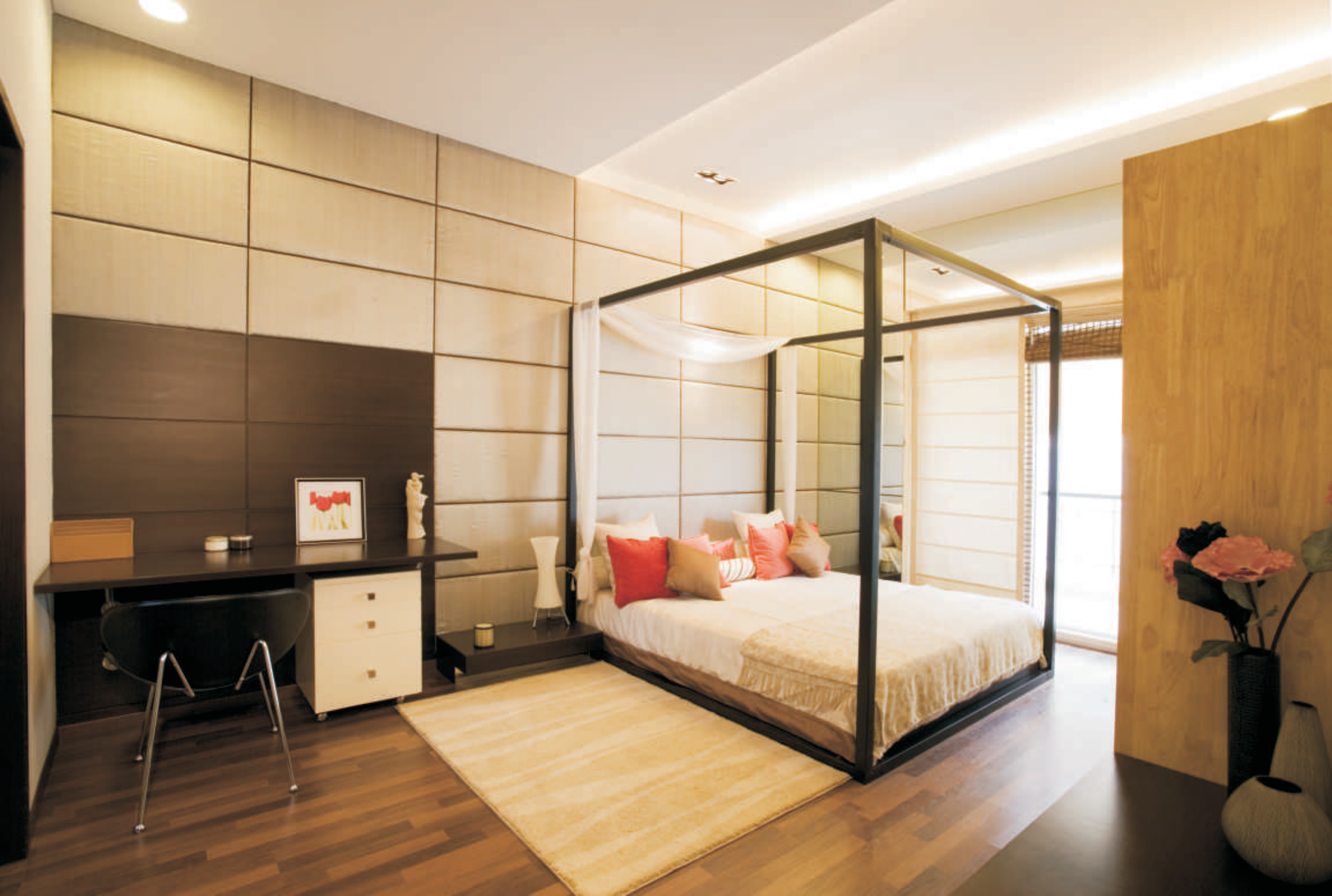
SHOT AT CYPRESS MODEL APARTMENT