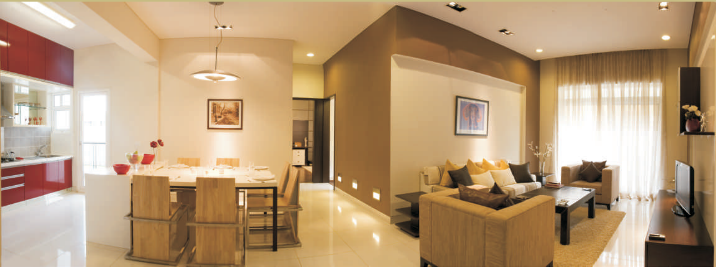
SHOT AT CYPRESS MODEL APARTMENT