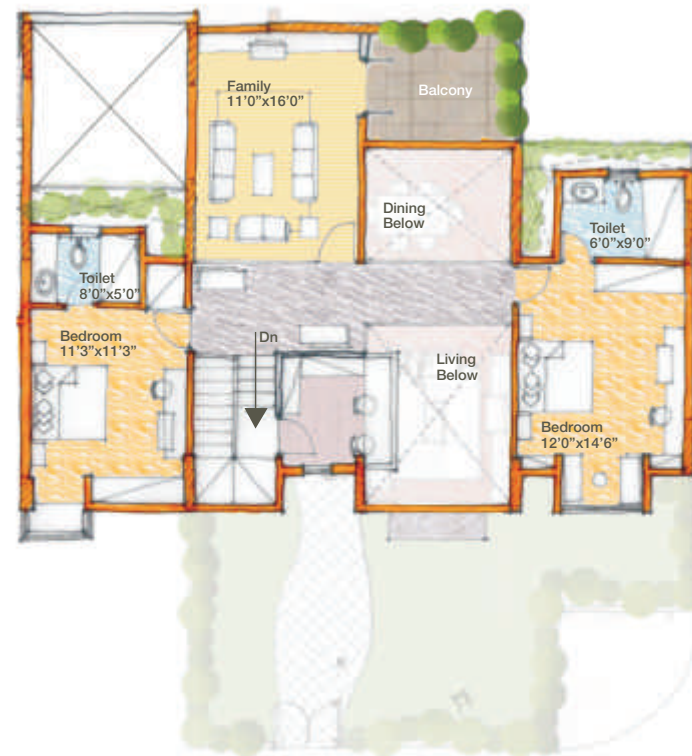
Level . 2