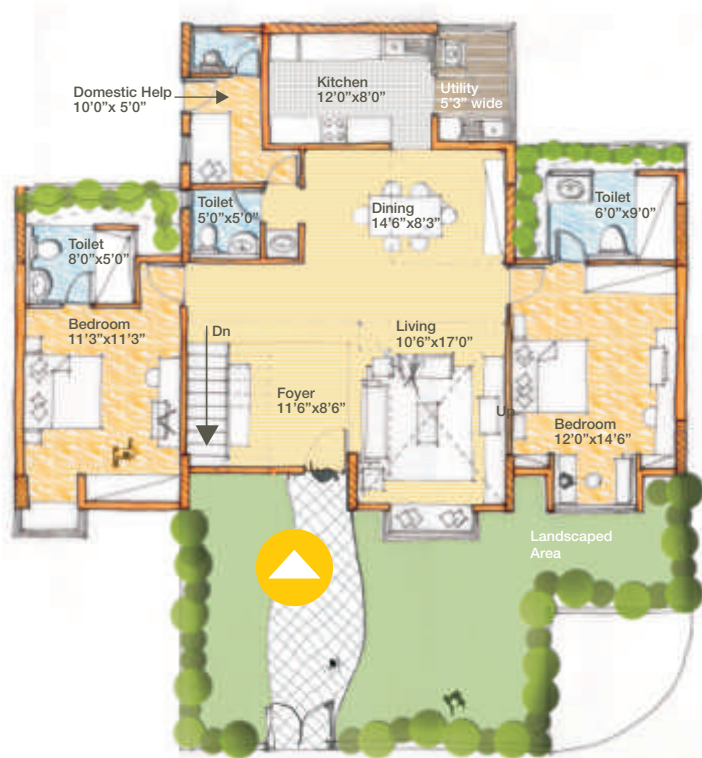
Level . 1