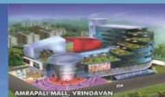
AMRAPALI MALL, VRINDAVAN