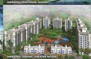
AMRAPALI GRAND, GREATER NOIDA