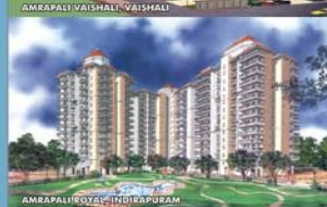
AMRAPALI ROYAL, INDIRAPURAM