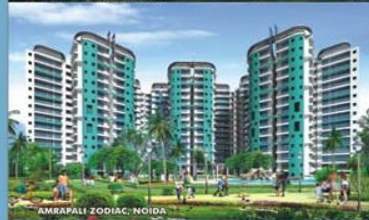
AMRAPALI ZODIAC, NOIDA