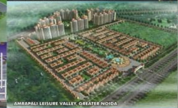
AMRAPALI LEISURE VALLEY, GREATER NOIDA

The group fully understands the importance of quality and ensures the best of technology, planning, design and construction for all of its projects.