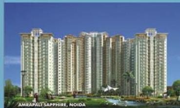
AMRAPALI SAPPHIRE, NOIDA

Various aspects of real estate and construction have been explored by Amrapali Group to such a grand extent that it has become a brand name. Amrapali Group successfully proved its forte in diverse fields ranging from Housing Projects to Commercial edifices to IT Parks to Educational Institutions. In the last couple of years Amrapali Group has contributed in the phenomenal growth of real estate and infrastructure industry with many turnkey solutions through multifaceted residential complexes.