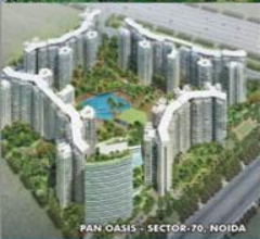
PAN OASIS - SECTOR-70, NOIDA