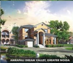
AMRAPALI DREAM VALLEY, GREATER NOIDA