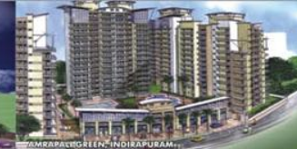
AMRAPALI GREEN, INDIRAPURAM