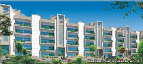
AMRAPALI CENTURION PARK, NOIDA