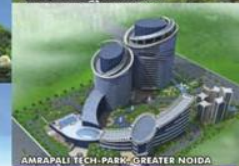
AMRAPALI TECH PARK, GREATER NOIDA