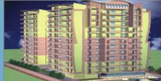
AMRAPALI VAISHALI, VAISHALI