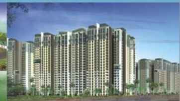
AMRAPALI GOLF HOMES, NOIDA EXTENSION