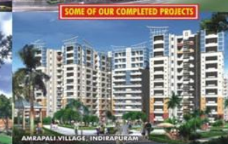
AMRAPALI VILLAGE, INDIRAPURAM