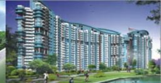
AMRAPALI PLATINUM, NOIDA