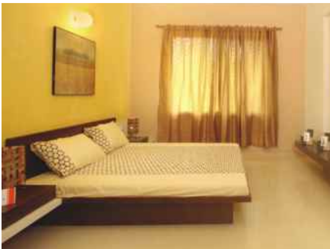
Master Bed Room-15'6" X 11'6"