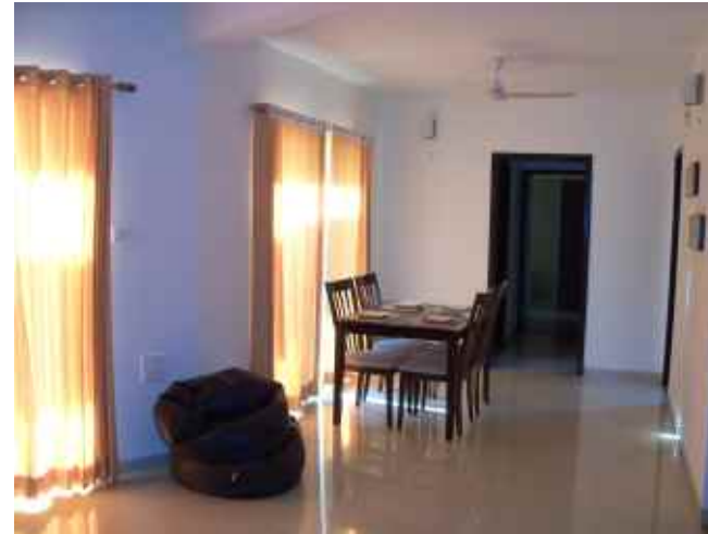
Dining-13' X 10'