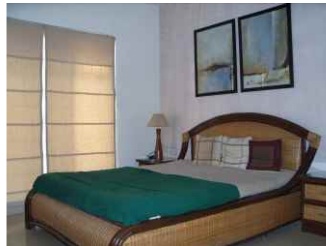
Bed Room-10'6" X 15'6"