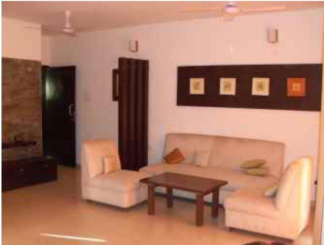
Living-10' X 17'