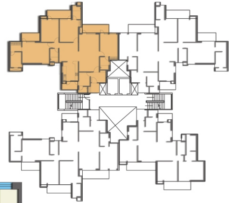
TOWER A TOWER B