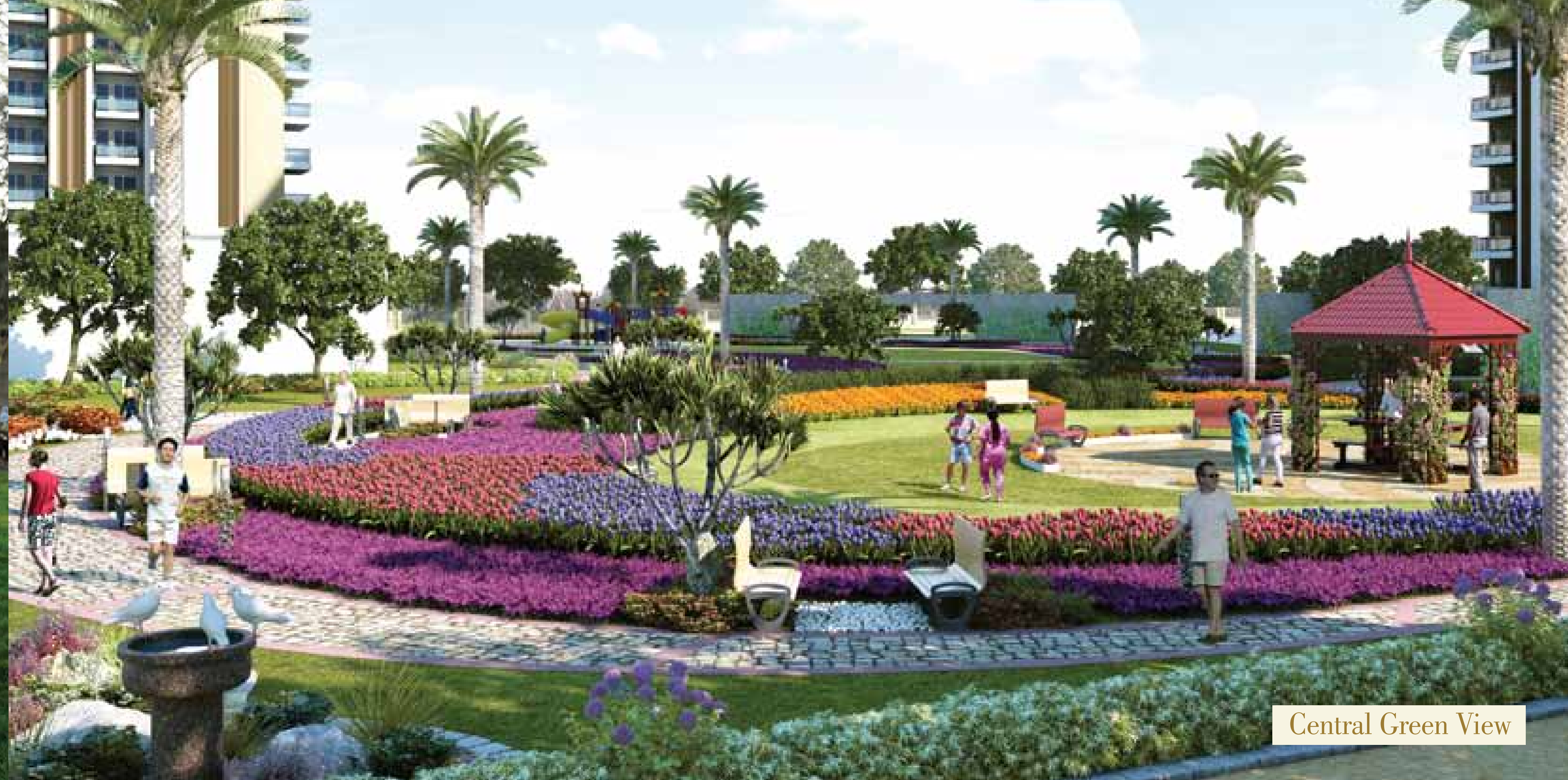
Central Green View