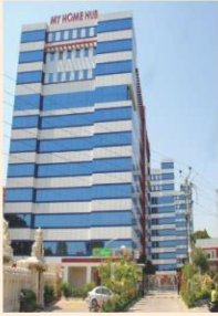
My Home Hub (2007)