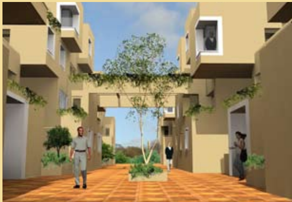
PAVED PEDESTRIAN AVENUE

Brigade Courtyard's 3½-acre campus will be dominated by a landscaped central courtyard. The apartment wings that surround three sides of the courtyard will create a large, sheltered space—where children can play and adults relax. Further extending the sense of open spaces, the courtyard will lead into a picturesque paved pedestrian avenue that will continue over the length of the site.