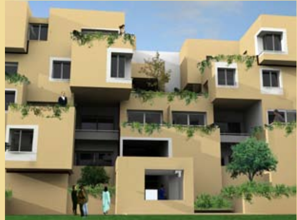
PRIVATE TERRACES WITH EACH APT