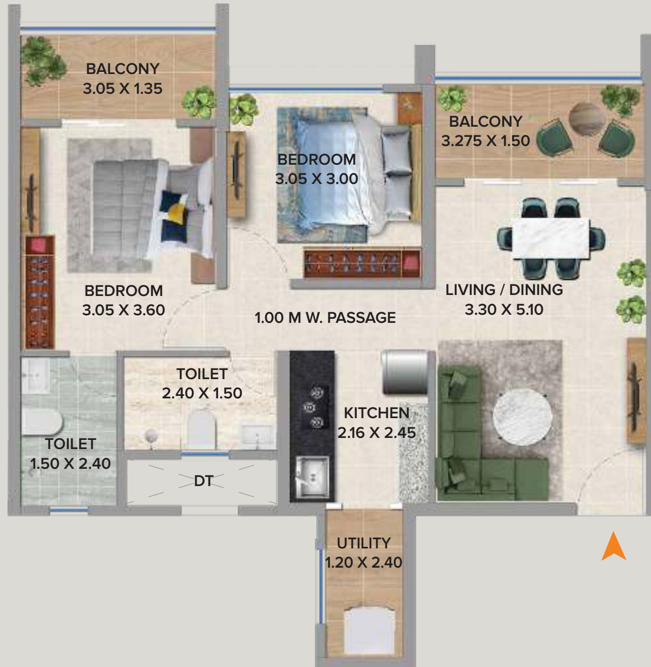
2 BHK TYPICAL UNIT PLAN