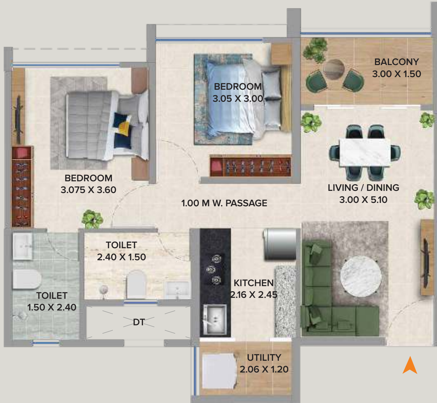
2 BHK TYPICAL UNIT PLAN