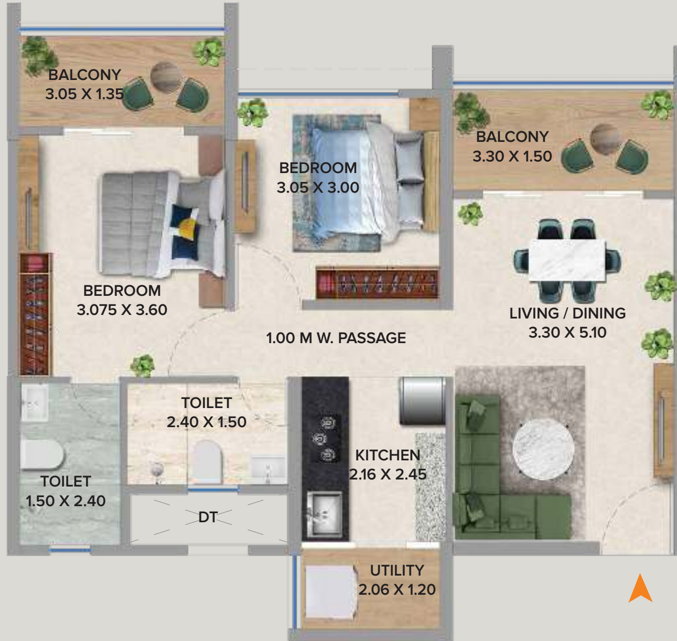
2 BHK TYPICAL UNIT PLAN