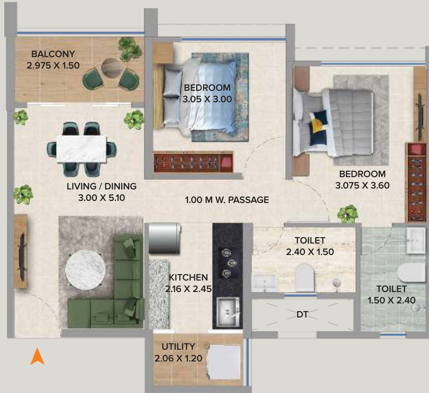
2 BHK TYPICAL UNIT PLAN