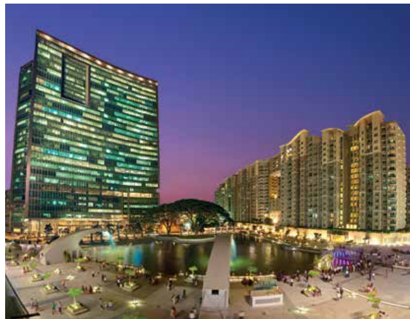
Actual shot of Brigade Gateway, Bengaluru

Brigade Group is among the few developers who also enjoy a reputation of developing Grade A commercial properties. Some of the Group's commercial development includes, the World Trade Center Bengaluru & Kochi, Software and IT parks, SEZs and stand-alone offices having reputed international clients operating from them.