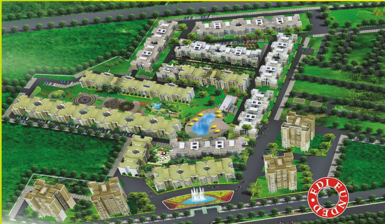
Artistic impression of aerial view of Crescent Park, Gurgaon