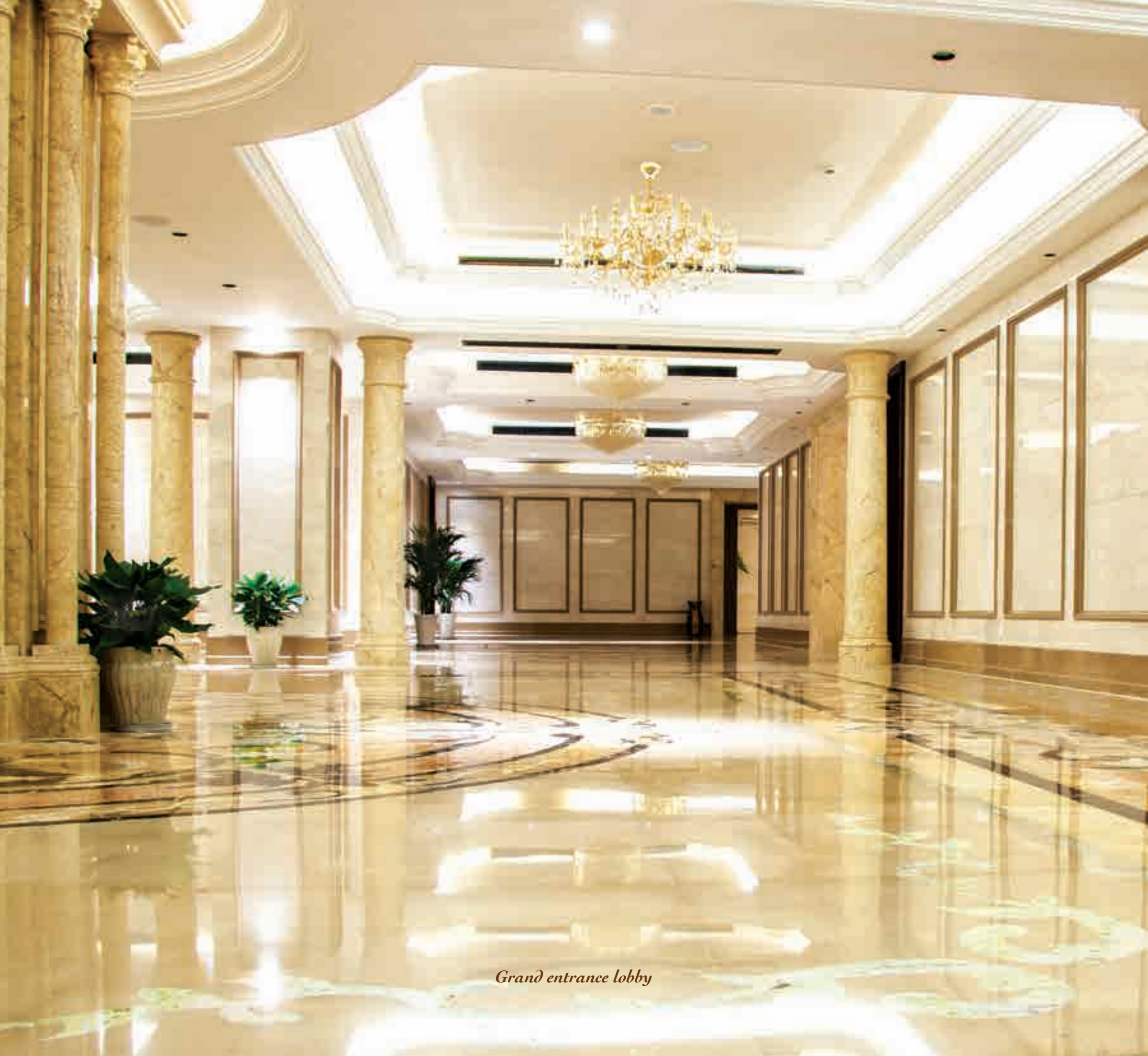
Grand entrance lobby