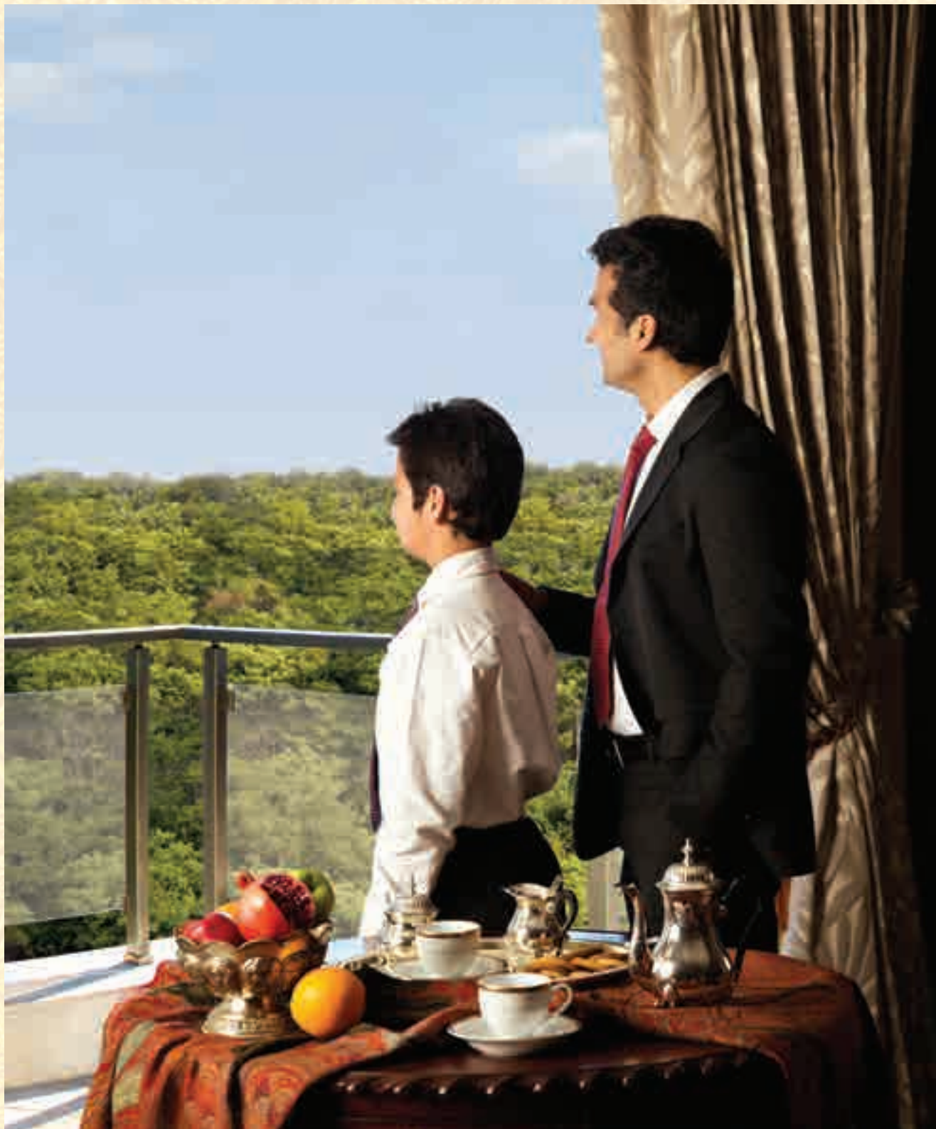
Overlooking the Jahanpanah City Forest