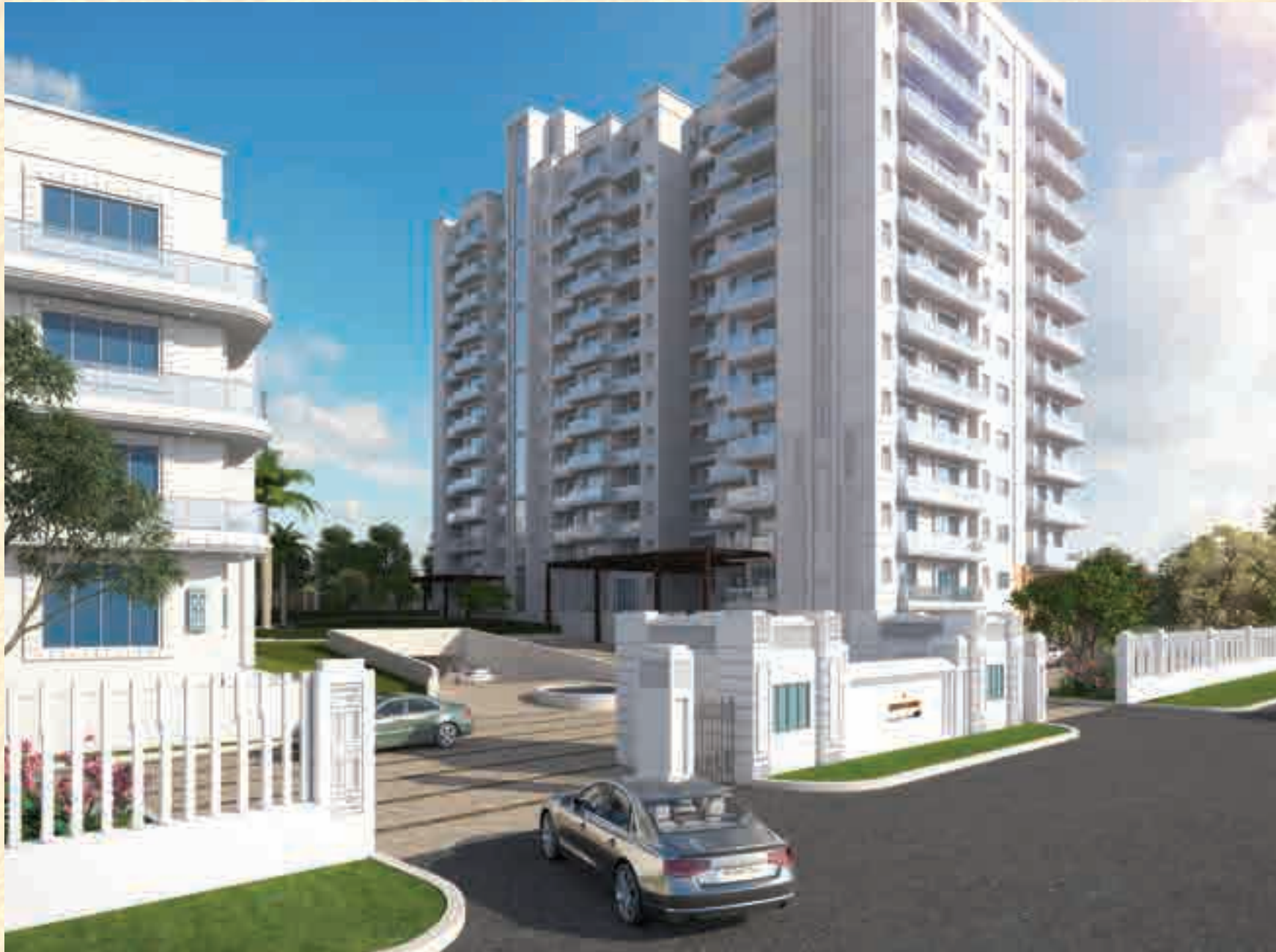
Entrance - Perspective view