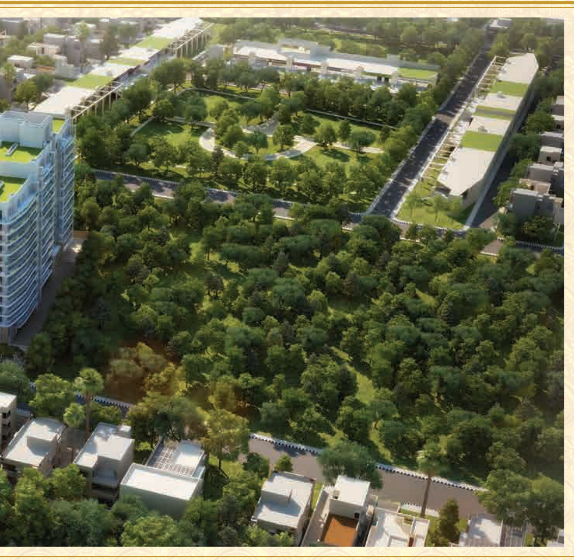
Perspective aerial view