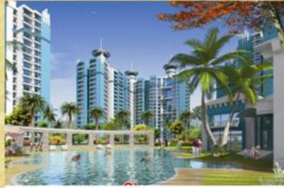
Glory Sector-46, Noida