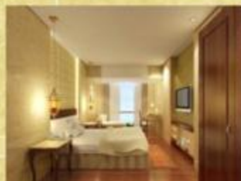
Driven by design, the meticulous planning infuses life into the space