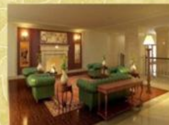
From glorious living to luxurious features the Taj Wellington has everything you need to make your life better

Call for Best Rate - 8860566696, 9211745471