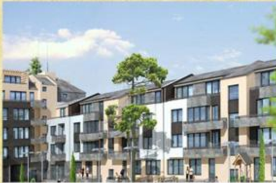
Aranya Vihar, Patna