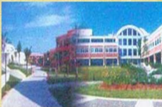
Hi-Tech City, Jaipur