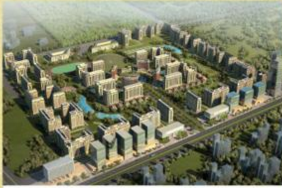
Golf City Sector - 75, Noida