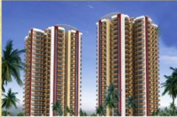
Grace Sector - 61, Noida