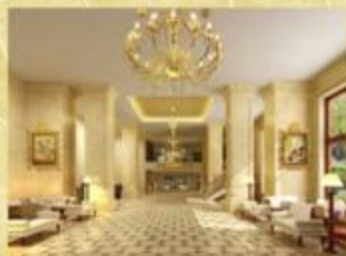
Discover the intimacy of ultimate luxury

Where inspired living comes in layered form of elegance