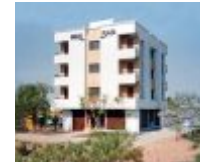
INDUS PLAZA Ayodhya Bypass, Bhopal