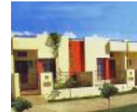
INDUS TOWNE Hoshangabad Road, Bhopal