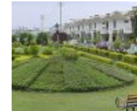
INDUS PARK Ayodhya Bypass, Bhopal