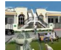
INDUS ESTATES Karariya, Bhopal