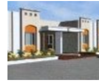
INDUS TOWNE Pithampur, Indore