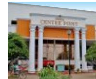
INDUS CENTRE POINT E-8 Extn., Indus Gardens, Bhopal