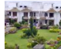
INDUS GARDENS E-8 Extn., Bhopal