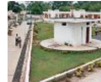
INDUS CITII... Nishatpura, Bhopal