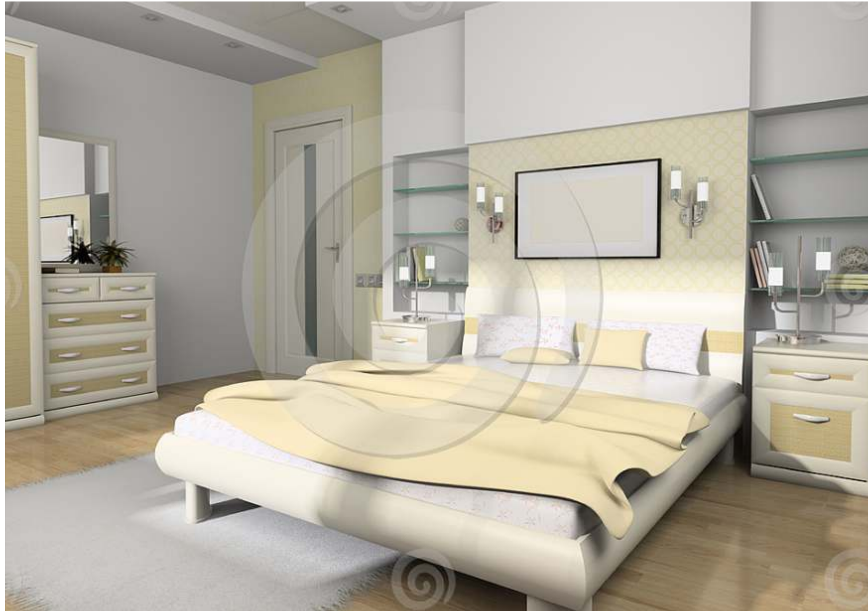
✓ Wallfort Heights - 3BHK(M)