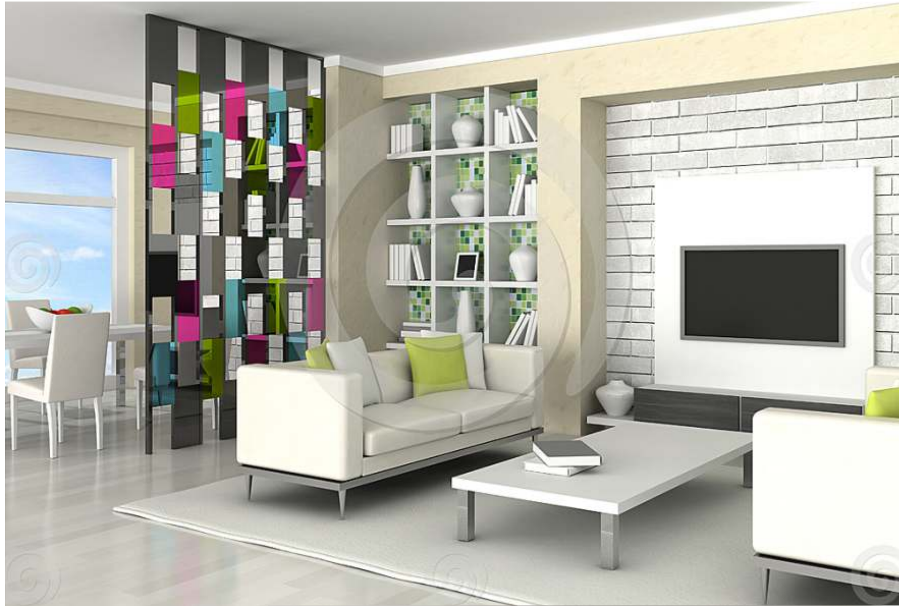
✓ Wallfort Heights - 3BHK(S)