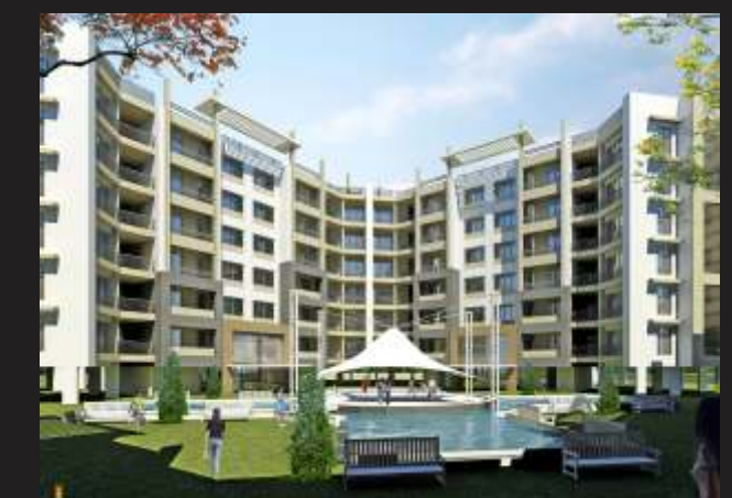
Walfort Enclave II