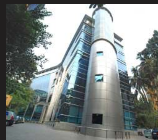
Boston House, Mumbai