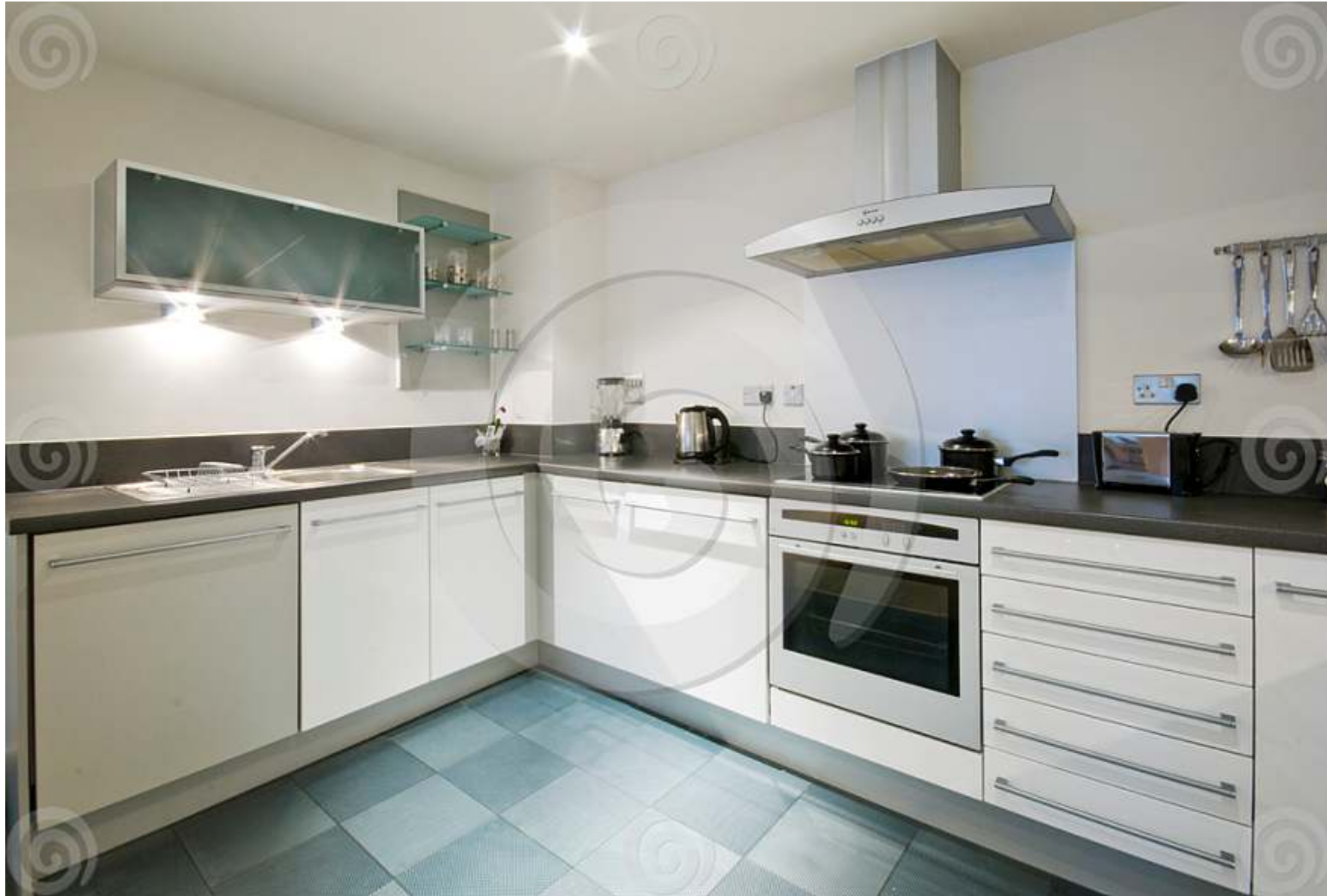
✓ Wallfort Heights - 3BHK(L)

Kitchen: The health and nutrition of the home is determined by the kitchen and we have accorded utmost importance to this space by giving utility area that maximise productivity and efficiency.