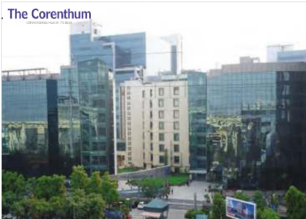
CORPORATE PARK | Sector 62, Noida