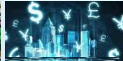
50 investment proposals worth Rs 7,000 crore from international investors

Existing upcoming projects are just a small indicator of Noida's growth potential.