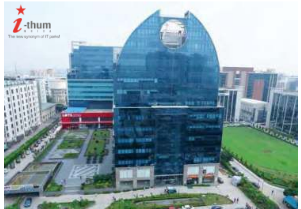
IT PARK | Sector 62, Noida