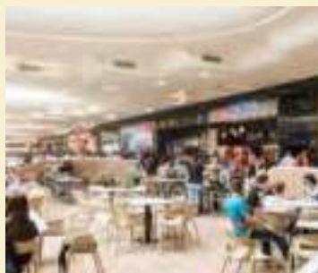
Assorted food hall

While the retail center is sure to attract a vibrant mix of high street retail, experiential stores, and luxury brands, Tastefully designed Gourmet Galleria is conceived to deliver a tantalizing experience for the entire spectrum of visitors ranging from regular eatery seekers to enthusiastic foodies and experience seekers.