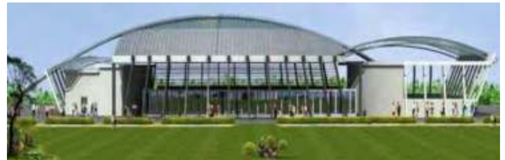
ICE SKATING RINK & INDOOR STADIUM | Dehradun , Uttarakhand