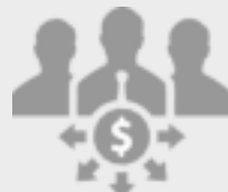
Attraction for investors

IT Parks also create significant spinoff benefits. Some of them are