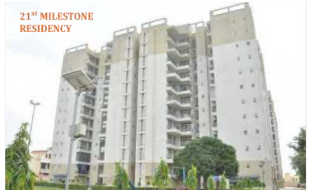
Rajnagar Ghaziabad | 2 & 3 BHK Apartments