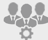
The establishment of companies