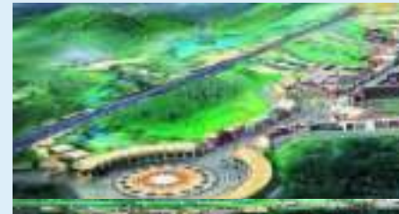
Proposed Film City