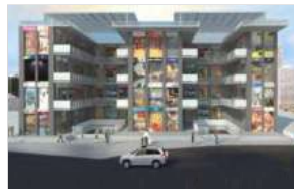
DELTA CITY CENTRE SHOPPING CENTER Sec Delta 1, Greater Noida