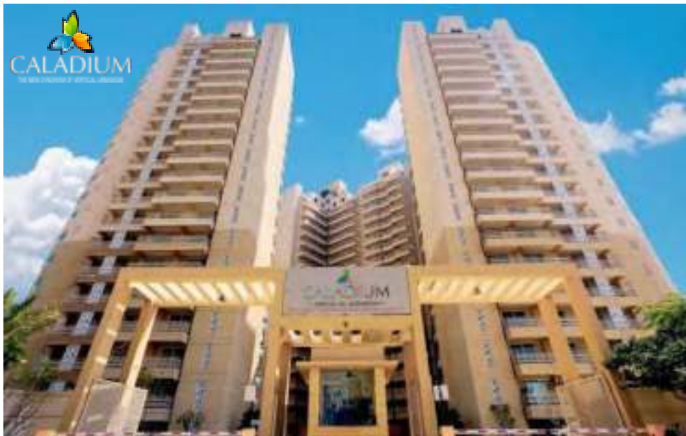
Sector 109, Gurugram | 3 & 4 BHK Apartments & Penthouses