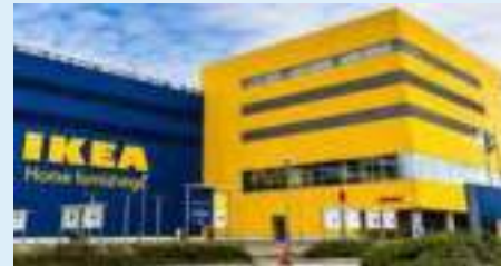
IKEA is all set to begin work of its biggest store in Noida.