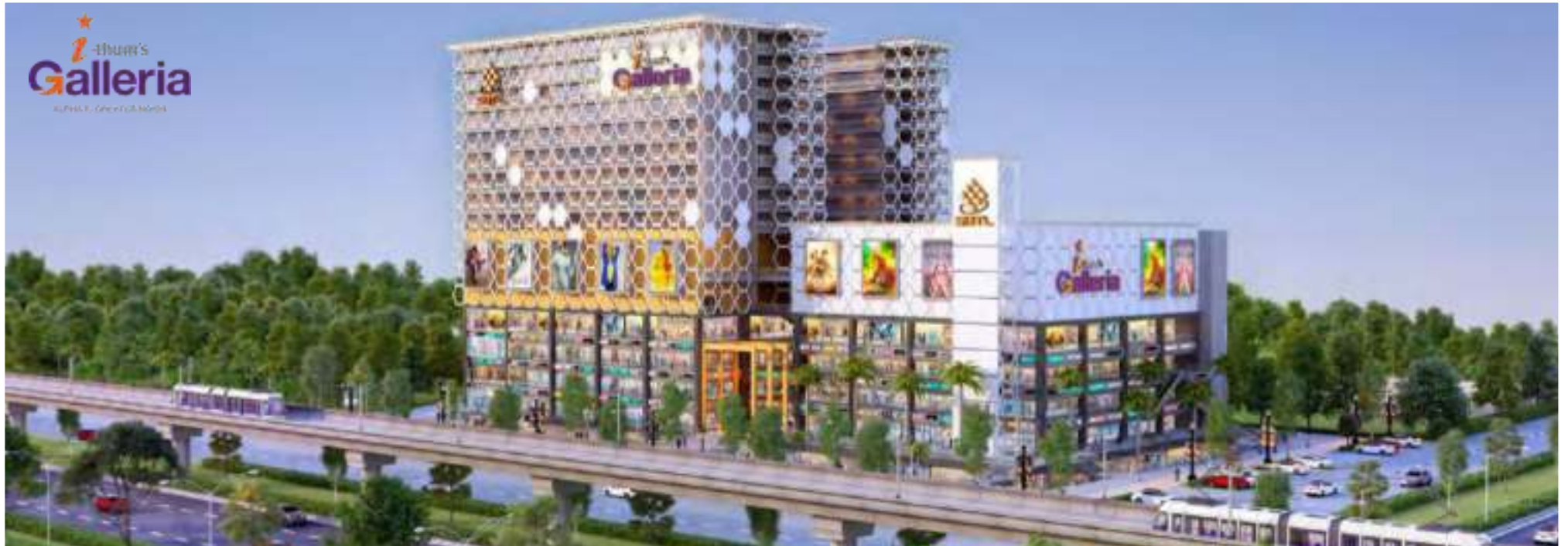
Alpha II, Greater Noida