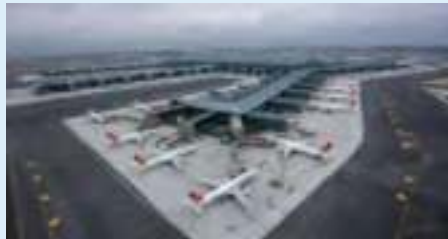
Jewar International Airport

There is no denying the fact that NOIDA is 'the investment hotspot' for the real estate sector in North India