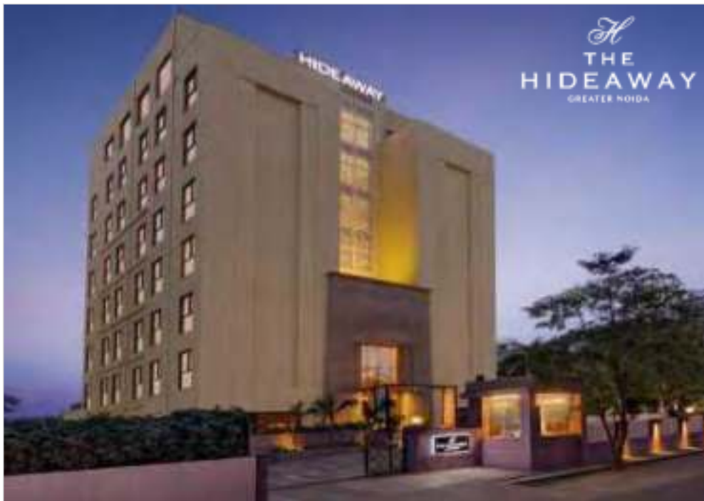
HOTEL | Knowledge Park 1, Greater Noida