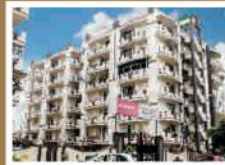
Actual Site Picture JM Royal Park - Vaishali