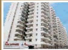
Actual Site Picture JM Park Sapphire - Vaishali