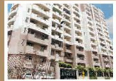
Actual Site Picture JM Royal Legacy - Vasundhara