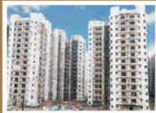
Actual Site Picture JM Orchid - Noida