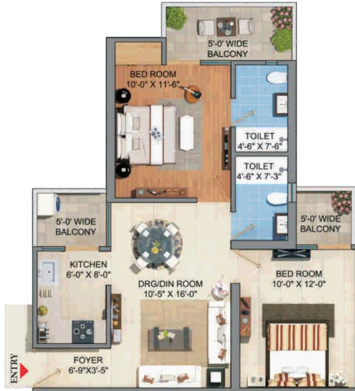
Super Area : 930 sq. ft.