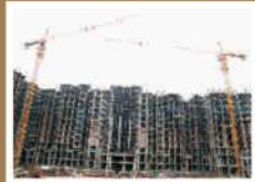
Actual Site Picture JM Aroma - Noida