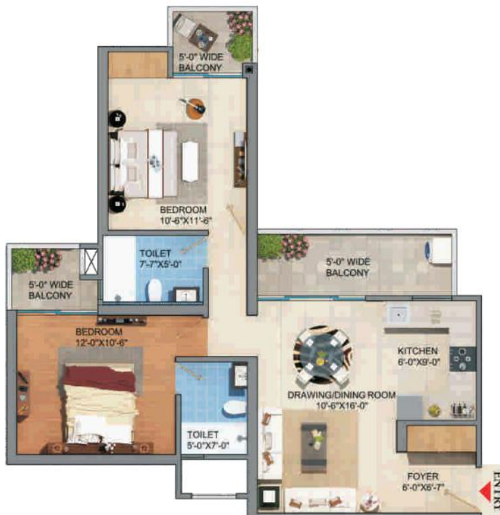
Super Area = 1060 sq. ft.