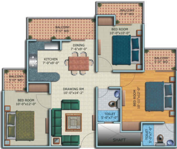
Super Area- 1275 sq.ft. 3 BHK + 2 Toilets + 4 Balconies