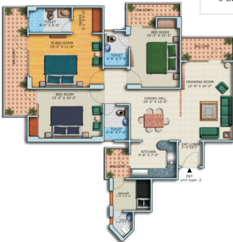
Super Area- 1850 sq.ft. 3 BHK + 4 Toilets + 4 Balconies + Servant Room