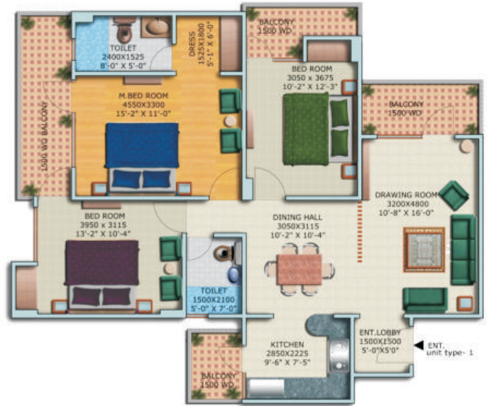
Super Area- 1585 sq.ft. 3 BHK + 2 Toilets + 4 Balconies