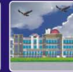
MSX Shopping Arcade, Tronica City