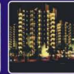
MSX Gardenia, Tronica City