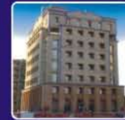
MSX Tower I, Greater Noida