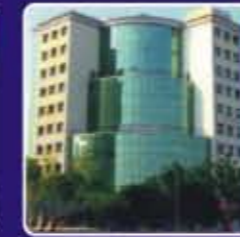
MSX Tower II, Greater Noida