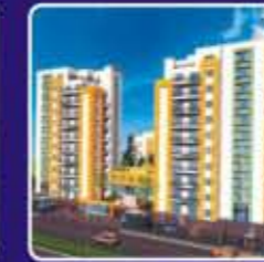
Golf Gardenia, Greater Noida