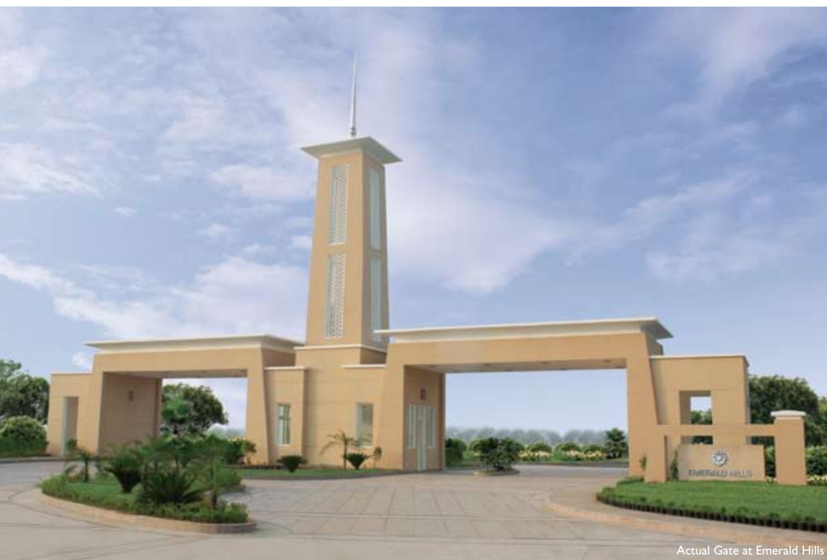
Actual Gate at Emerald Hills

Own a slice of freedom. Presenting Villa Plots at Emerald Hills.