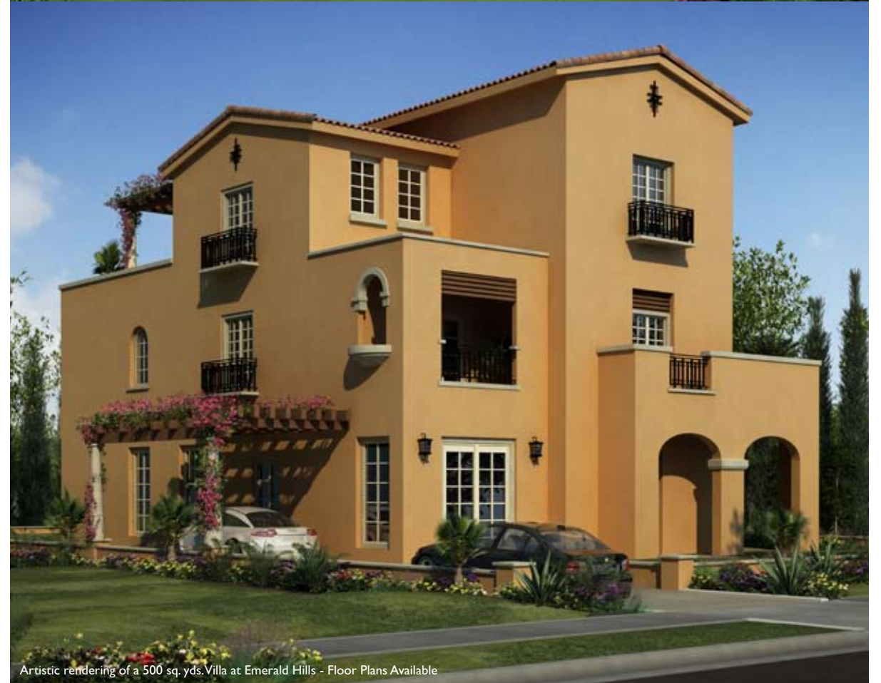
Artistic rendering of a 500 sq. yds. Villa at Emerald Hills - Floor Plans Available

Emerald Hills is an exclusive gated, secure, impeccably planned development in Gurgaon where all the residents' needs are literally at the doorstep. Four enclaves of ultra-luxurious sun-swept villas, villa floors and villa plots, with the finest in fit and finishes offer a quality of living second to none. Lavish outdoor and indoor spaces, parks, sports and recreational facilities, and shopping within the community itself complete the rich living experience.