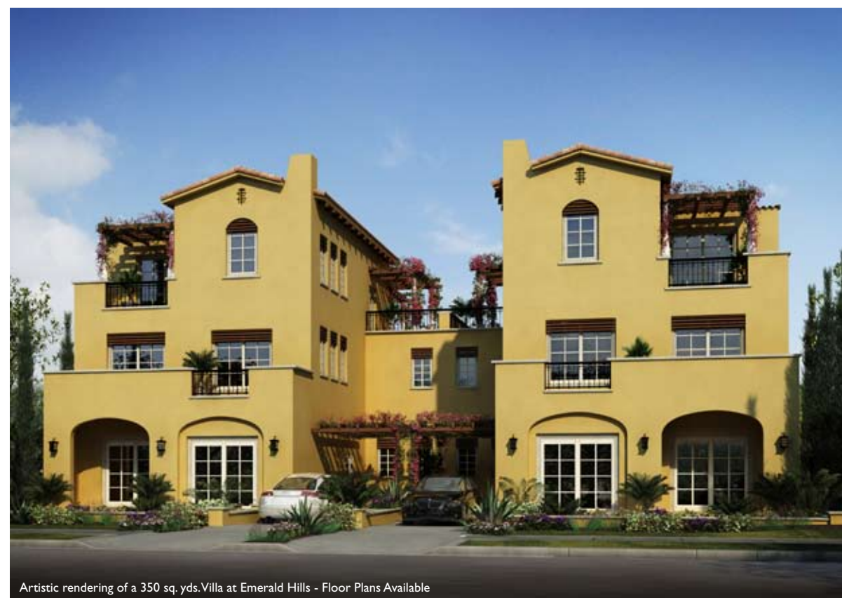
Artistic rendering of a 350 sq. yds. Villa at Emerald Hills - Floor Plans Available

Emerald Hills. One address, many choices.