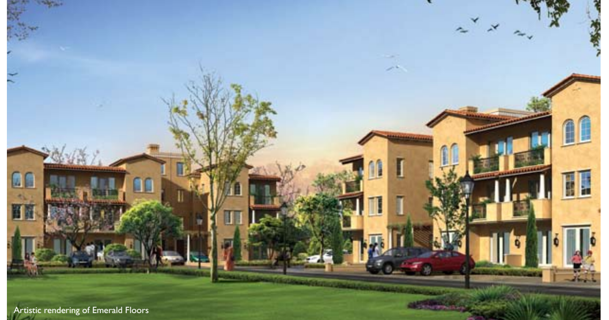
Artistic rendering of Emerald Floors