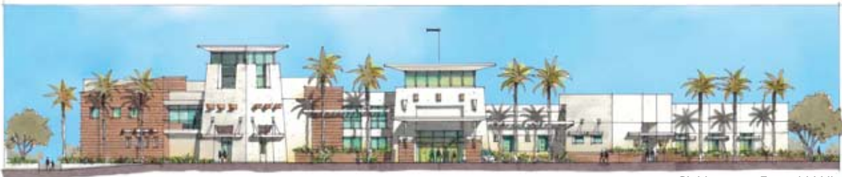
Clubhouse at Emerald Hills