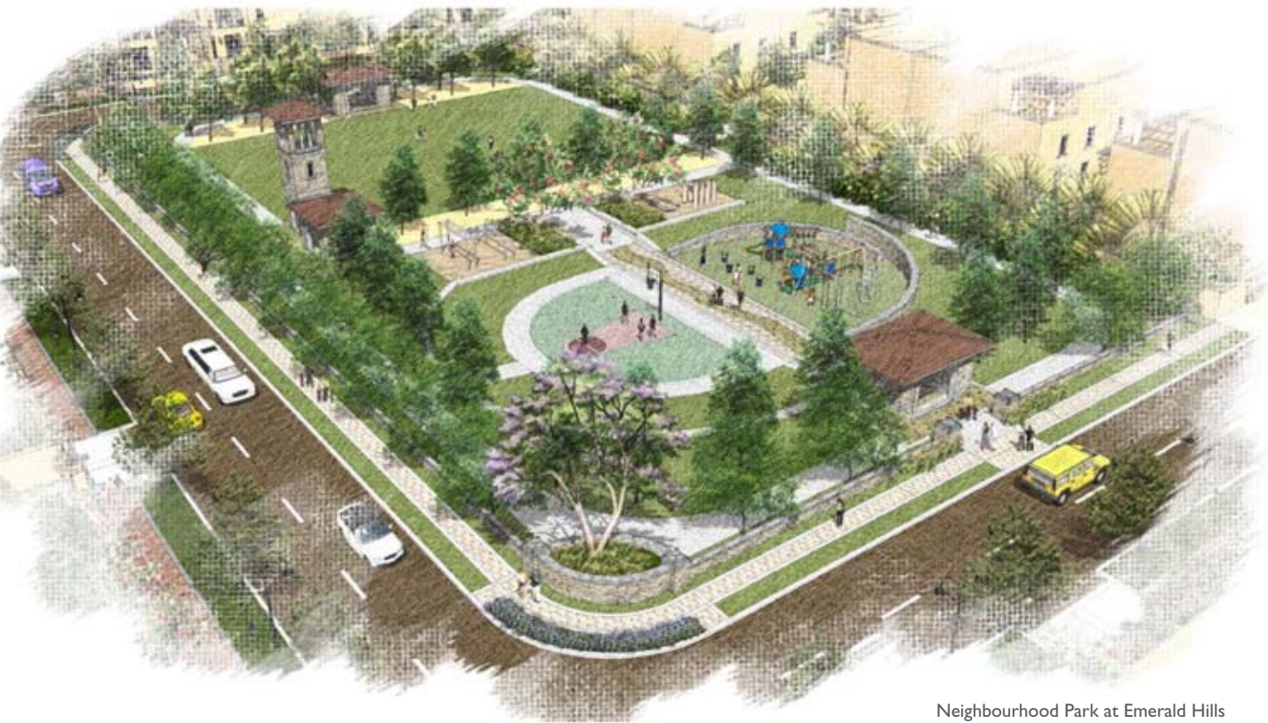
Neighbourhood Park at Emerald Hills